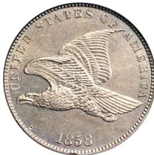
1858 Small Letters Flying Eagle Cent - PCGS MS62